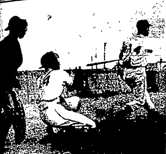
Coachman, hangs away at one of the PCHS-Milo Penquis Relays. The Guilford club held the meet.