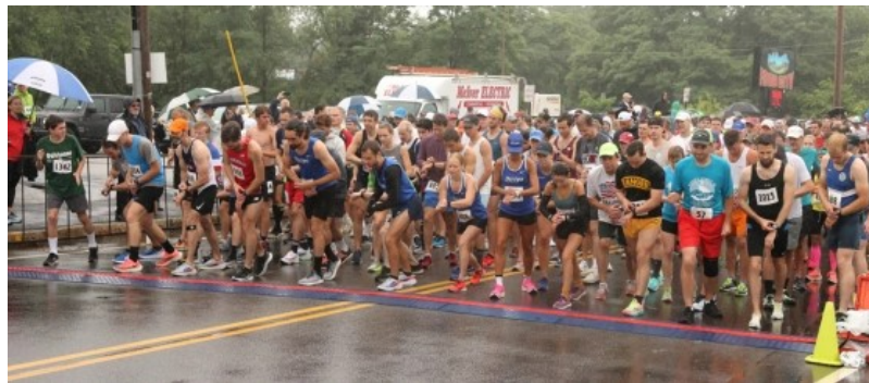
Ready to start their watches