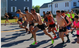
Competitors take off at the start of the July 21 Maine Potato Blossom Festival 5-Miler held in Fort Fairfield.