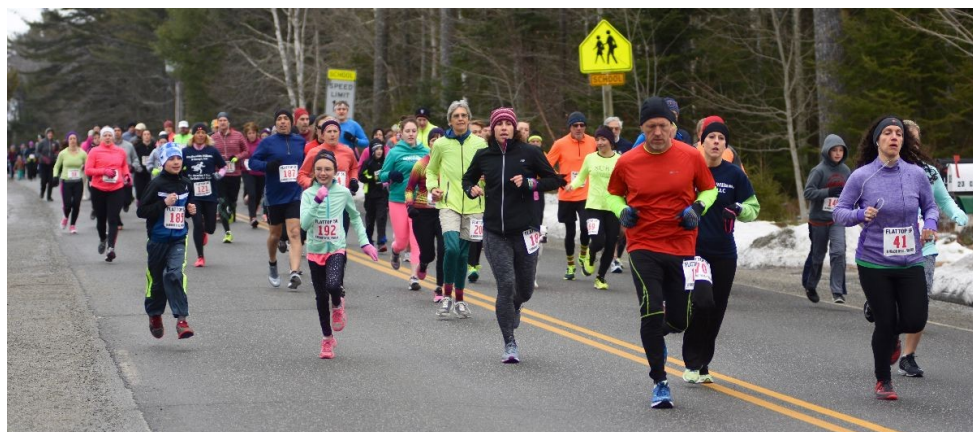
Runners take off at the start of Saturday's Flattop 5K.